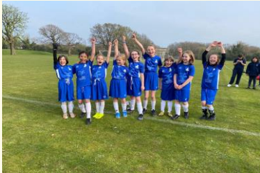
Well done girls!

We would like to say a massive thank you to the coaches and the parents for being a great crowd and cheering us on!