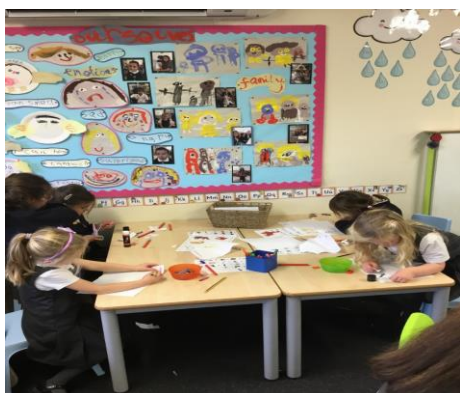
Orion Class enjoying lots of fun activities.