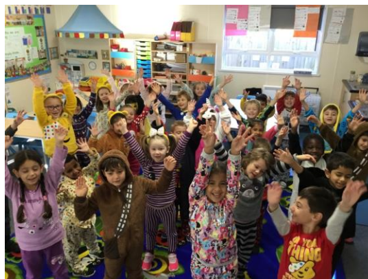
The children in Luna class enjoyed a lovely cosy day in their pyjamas/onesies!