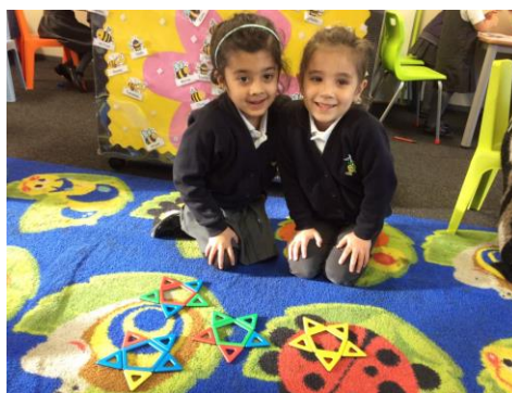
'We love using our different construction materials to create lots of different shapes!'