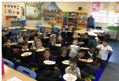
As part of our exciting Design and Technology project, Nova Class have had great fun designing, making and evaluating their own healthy snacks.