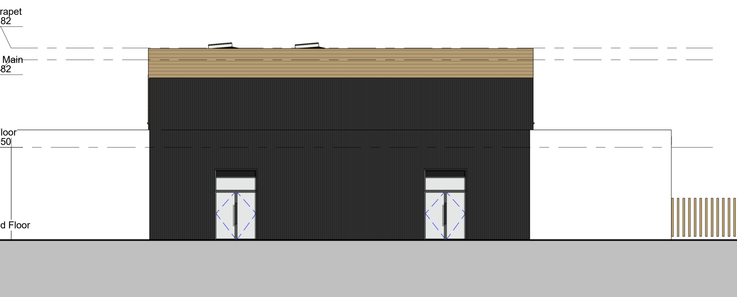
3 West Elevation to Halls 1: 100