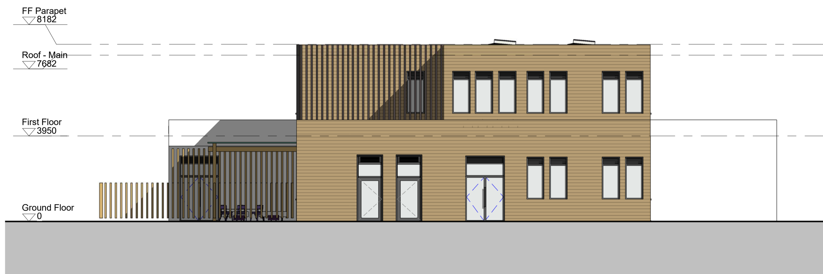
4 East Elevation 1: 100