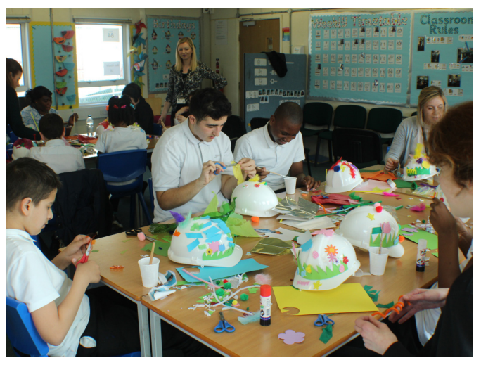
The pupils at Oak Lodge Special Educational Needs School make Easter bonnets with a twist

The Junior Builders at Morelands Primary School carry out an inspection to make sure our works are up to their standards